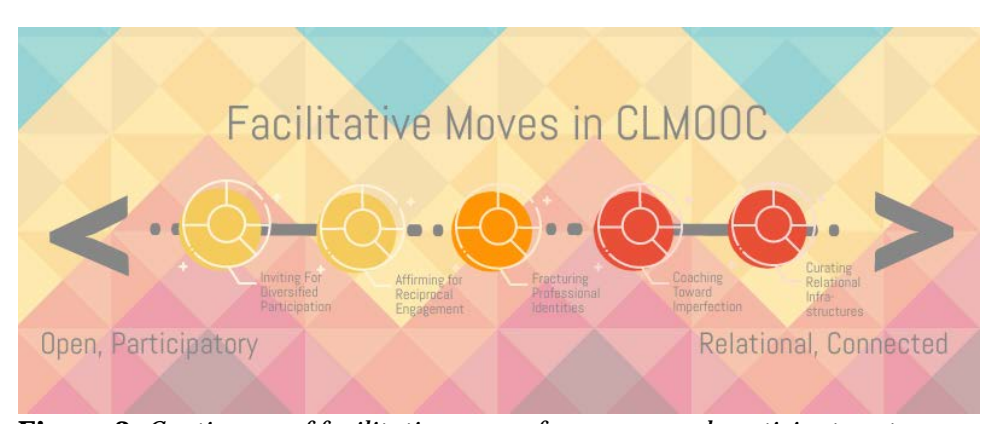
Figure 2. Continuum of facilitative moves from open and participatory to relational and connecting.

Each of these professional learning facilitation moves exists on a continuum that moves from open and participatory learning to relational and connected learning. While inviting and affirming are essential practices to support the emergence of open online communities, coaching toward imperfection and curating relational infrastructures are facilitative practices that can be taken up as part of systematic infrastruring strategies. Both coaching toward imperfection and curating relational infrastructures offer flexible, visible, connective structures that educators can use to develop divergent relationships and practices with other educators, with unfamiliar composing technologies and with more open-ended aims of professional learning.