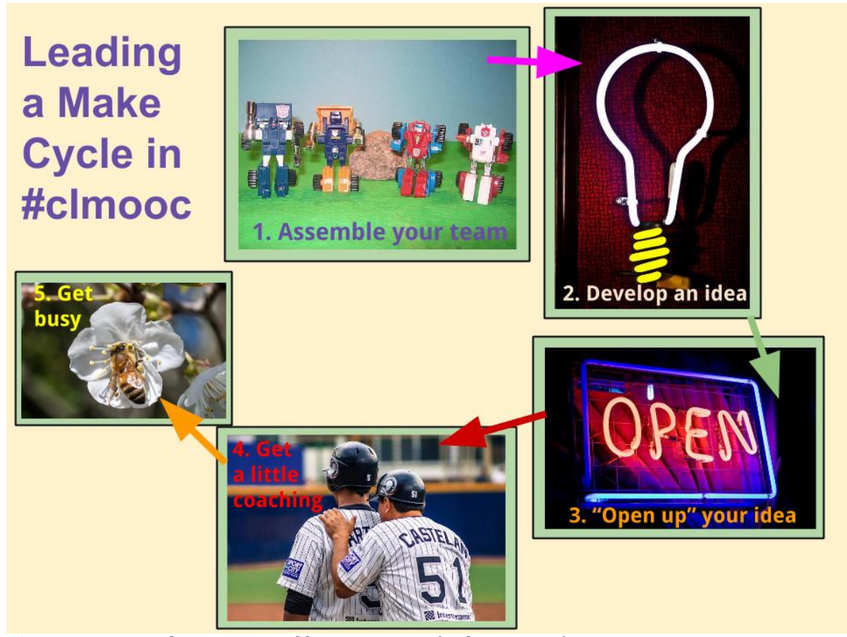
Figure 3. Remixed image created by participant-facilitator Joe from open source images on Flickr

(http://thecurrent.educatorinnovator.org/resource/6335).